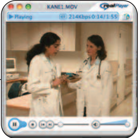
Multimedia Teaching Tool: Resident as Teacher